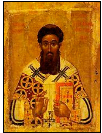
Saint Gregory Palamas

Observance is inseparable , in fact, from the issue of traditionalism. Following the teachings and instructions of St. Gregory Palamas, an observant Orthodox Christian is one who follows Holy Tradition: the laws of God, beginning with the Ten Commandments, the commandments of love set forth by Christ Himself (that is, to love God above all else and to love one’s neighbor as one loves himself), and the Sacred Canons of the Church. St. Gregory, in various writings, also tells us, in keeping with the consensus of the Fathers, that the traditions and customs that constitute the Holy Tradition of the Church must be observed in toto —not selectively and, as is usually the case today, with a self-serving application of the oft-made distinction between Holy Tradition and “traditions” with a small “t,” the latter supposedly a matter of choice and the former binding. While the distinction between Holy Tradition and certain ecclesiastical customs of an incidental kind, or small “t” traditions, can be useful, it is in fact unknown to the Church Fathers in their definitive and punctilious comments about Holy Tradition per se . Moreover, it assuredly has no application to inspired Canons concerning matters of faith and of