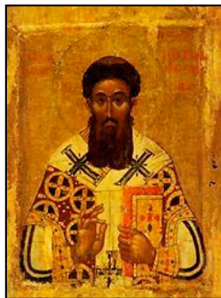
Saint Gregory Palamas

Observance is inseparable , in fact, from the issue of traditionalism. Following the teachings and instructions of St. Gregory Palamas, an observant Orthodox Christian is one who follows Holy Tradition: the laws of God, beginning with the Ten Commandments, the commandments of love set forth by Christ Himself (that is, to love God above all else and to love one’s neighbor as one loves himself), and the Sacred Canons of the Church. St. Gregory, in various writings, also tells us, in keeping with the consensus of the Fathers, that the traditions and customs that constitute the Holy Tradition of the Church must be observed in toto —not selectively and, as is usually the case today, with a self-serving application of the oft-made distinction between Holy Tradition and “traditions” with a small “t,” the latter supposedly a matter of choice and the former binding. While the distinction between Holy Tradition and certain ecclesiastical customs of an incidental kind, or small “t” traditions, can be useful, it is in fact unknown to the Church Fathers in their definitive and punctilious comments about Holy Tradition per se . Moreover, it assuredly has no application to inspired Canons concerning matters of faith and of