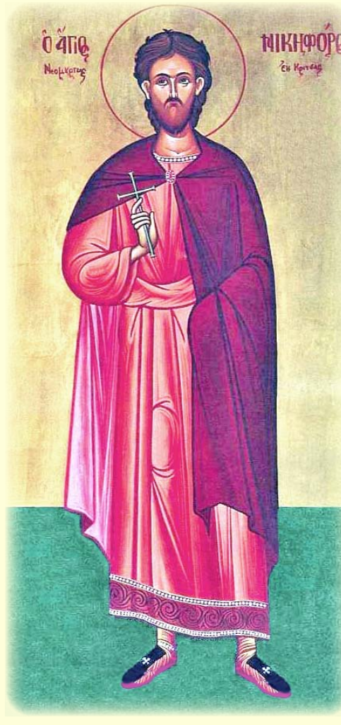
Holy New Martyr Nikephoros of Crete