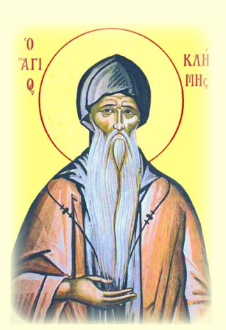
St. Clement, who struggled in asceticism on Mount Sagmatios