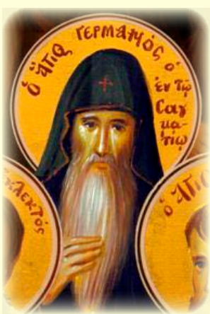
St. Germanos who struggled in asceticism on Mount Sagmatios