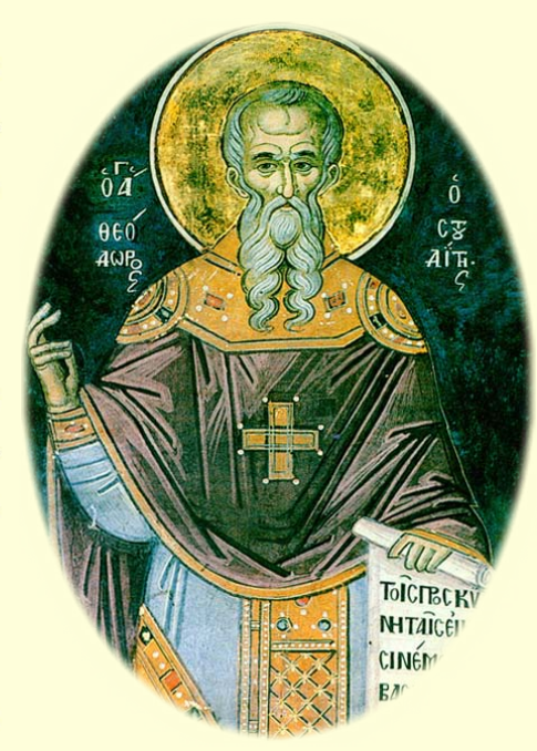
Translation of the Holy Relics of St. Theodore the Studite