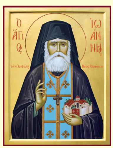
St. John the New Almsgiver, of Amphiale, Piræus ( read more here and here )