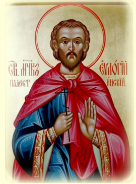
Holy Martyr Eulogios of Palestine

Holy New Hieromartyr Parthenios, Bishop of Didymoteichon in Thrace