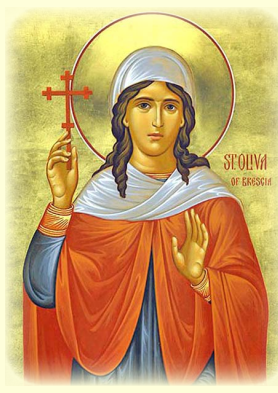
Holy Martyr Olivia of Brescia, Italy