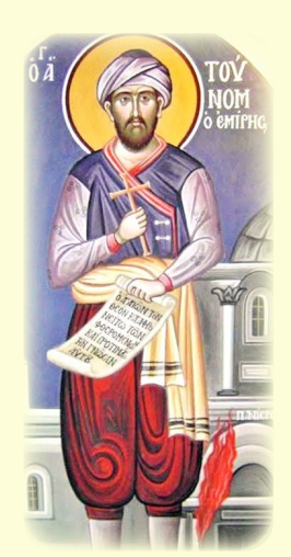
St. Tunom the Emir →