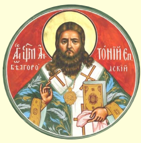
Holy New Hieromartyr Anthony (Pankeyev), Bishop of Belgorod