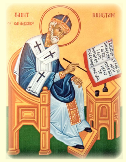
St. Dunstan, Archbishop of Canterbury