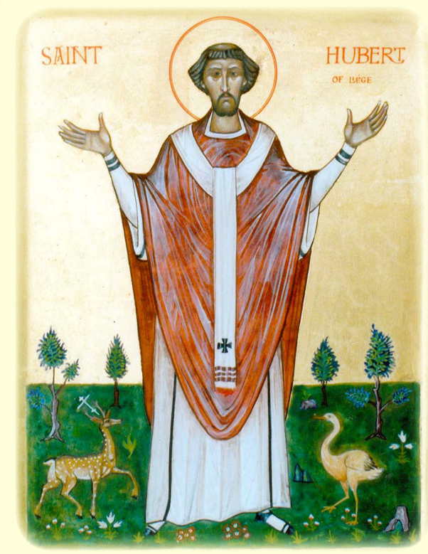
St. Hubert, Bishop of Liege in Belgium