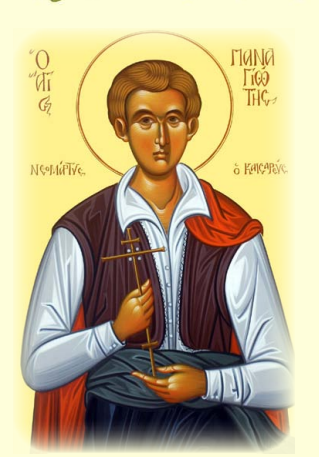
Holy New Martyr Panagiotes of Caesarea, martyred in Constantinople