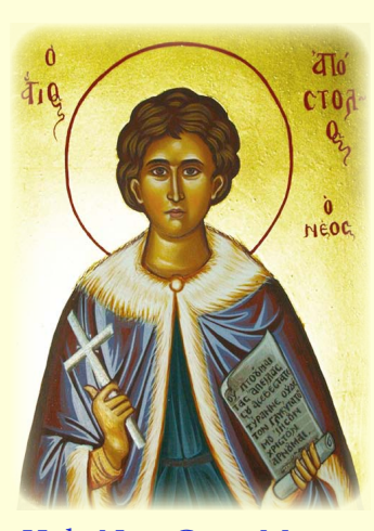
Holy New Great Martyr Apostolos, martyred in Constantinople