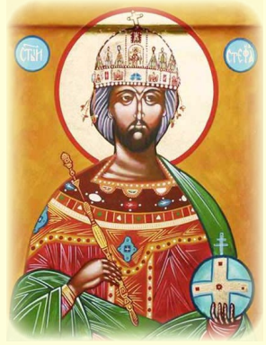
St. Stephen, King of Hungary