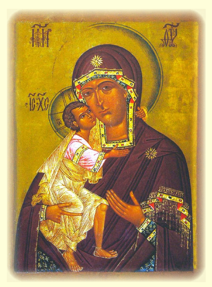
Synaxis of the "Feodorovskaya" Icon of the Most Holy Theotokos