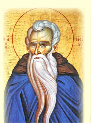
St. Neilos of Ericusios