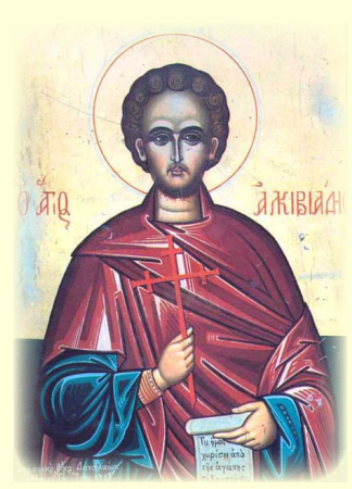
Holy Martyr Alcibiades of Gaul