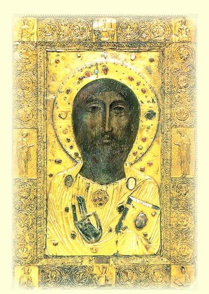
Synaxis of the Icon of our Lord and God and Saviour Jesus Christ "Not Made by Hands" in Georgia