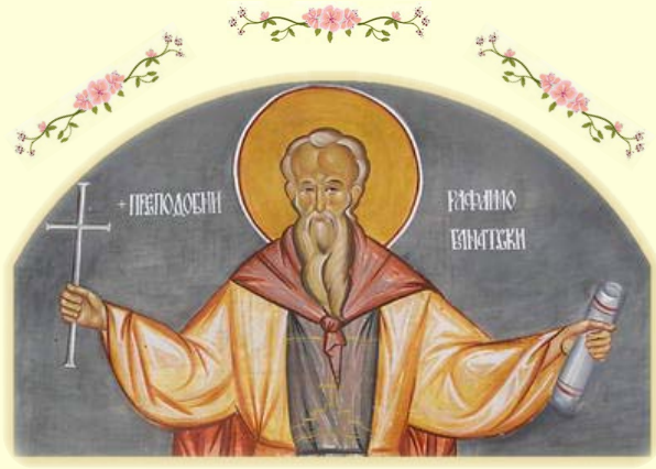
St. Raphael of Banat (Serbia)