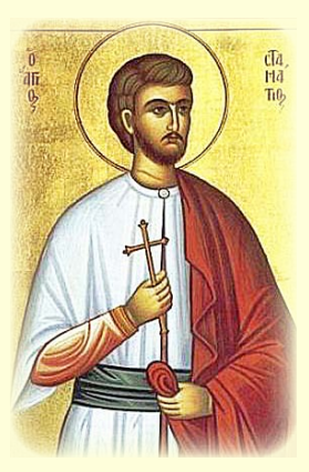
Holy New Martyr Stamatios of Volos