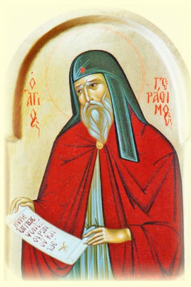
St. Gerasimos the New Ascetic of Cephalonia