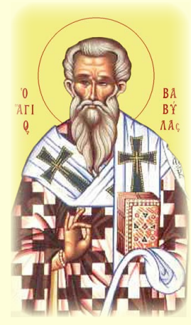
Holy Hieromartyr Babylas, Bishop of Antiochia