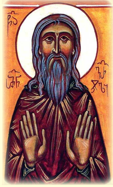
St. Symeon, Abbot of the Monastery of Davit-Gareji (Georgia)