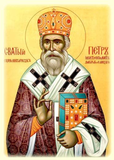
Holy Hieromartyr Peter, Metropolitan of Dabro-Bosnia