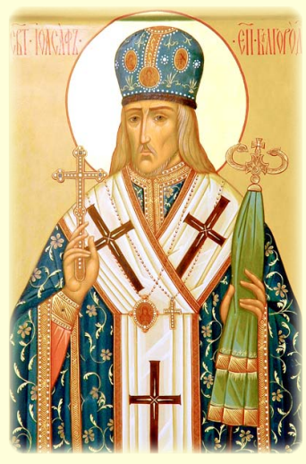
Uncovering of the Relics of St. Joasaph, Bishop of Belgorod