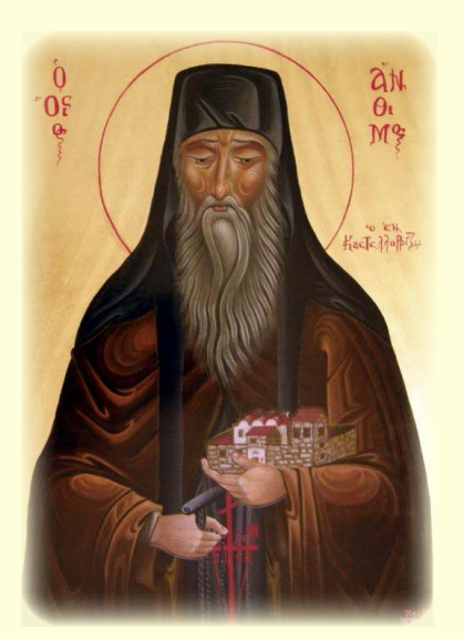
Ascetic of Cephallonia