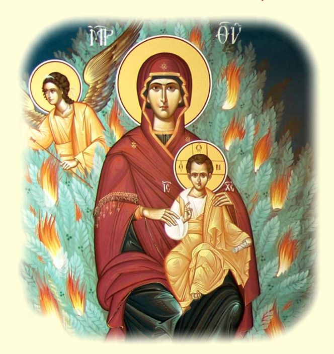
Synaxis of the Icon of the Most Holy Theotokos called "The Burning Bush"

all tates of the met of the tates of the total