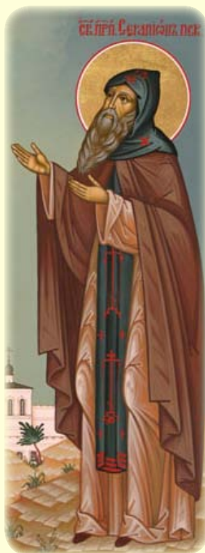
St. Serapion of Pskov