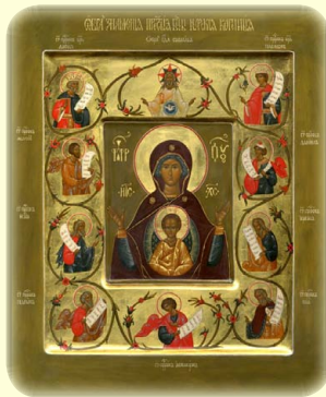
Synaxis of the Kursk-Root Icon of the Most Holy Theotokos, “of the Sign”