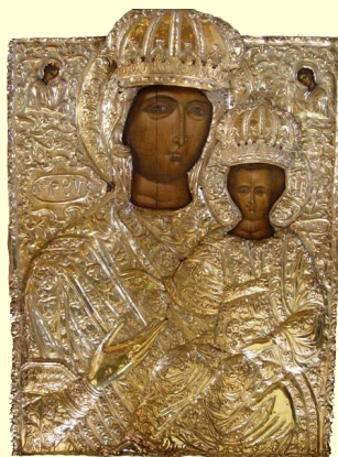
Synaxis of the Icon of the Most Holy Theotokos «Panagia Kalamiotissa» (Anafi)