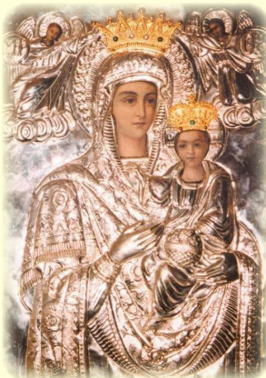
Synaxis of the Icon of the Most Holy Theotokos "Panagia Arethiotissa" (Amphilochia)