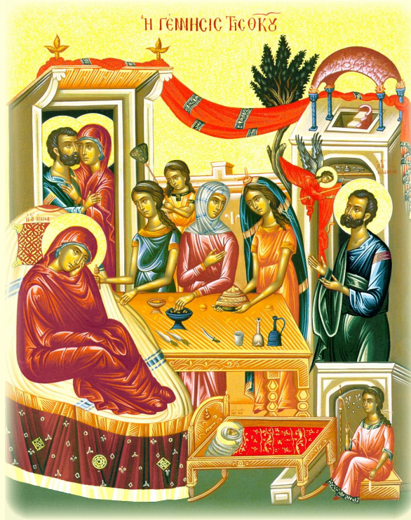
Nativity of our Most Holy Lady, the Theotokos and Ever-Virgin Mary