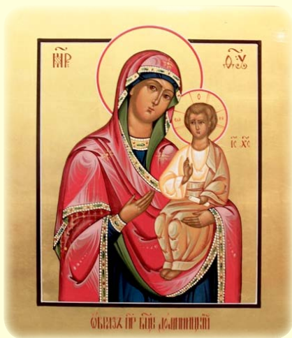
Synaxis of the Domnitsk Icon of the Most Holy Theotokos