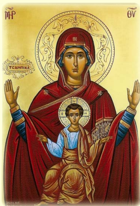
Synaxis of the Icon of the Most Holy Theotokos «Panagia Tsembika» (Rhodes)