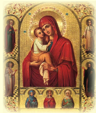
Synaxis of the Icon of the Most Holy Theotokos of Pochaev