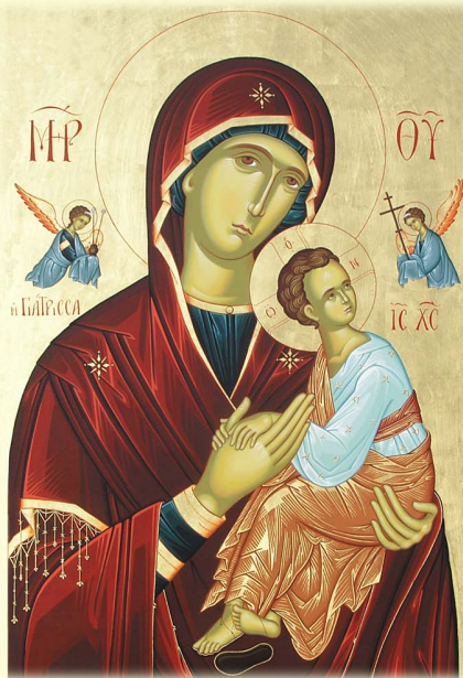
Synaxis of the Icon of the Most Holy Theotokos «Panagia Giatrissa»