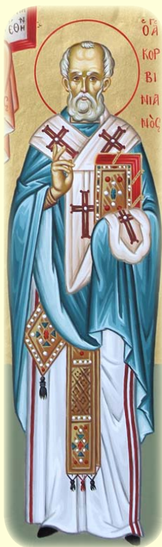
St. Corbinian, Bishop of Freising (Bavaria)