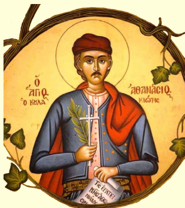
Holy New Martyr Athanasios