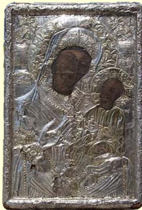
Synaxis of the Icon of the Most Holy Theotokos "Panagia Skiadeni" (Rhodes)