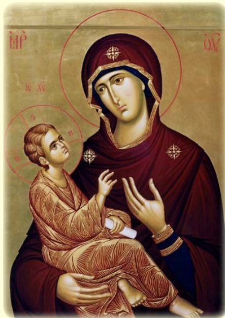
Synaxis of the Icon of the Most Holy Theotokos of Kholm