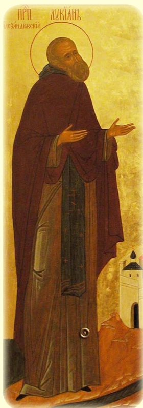
St. Lucian, Abbot, of Alexandrov