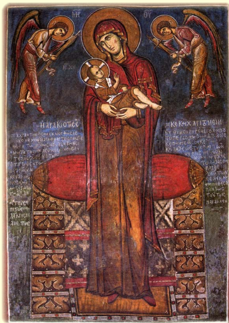
Synaxis of the Icon of the Most Holy Theotokos "Panagia Arakiotissa" (Cyprus)