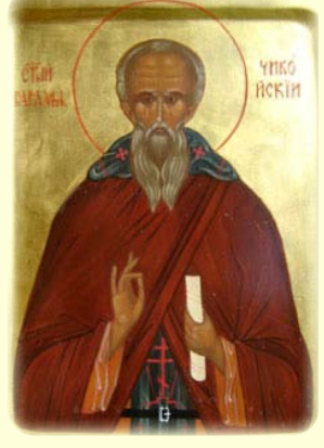
St. Varlaam, desertdweller of Chikoysk